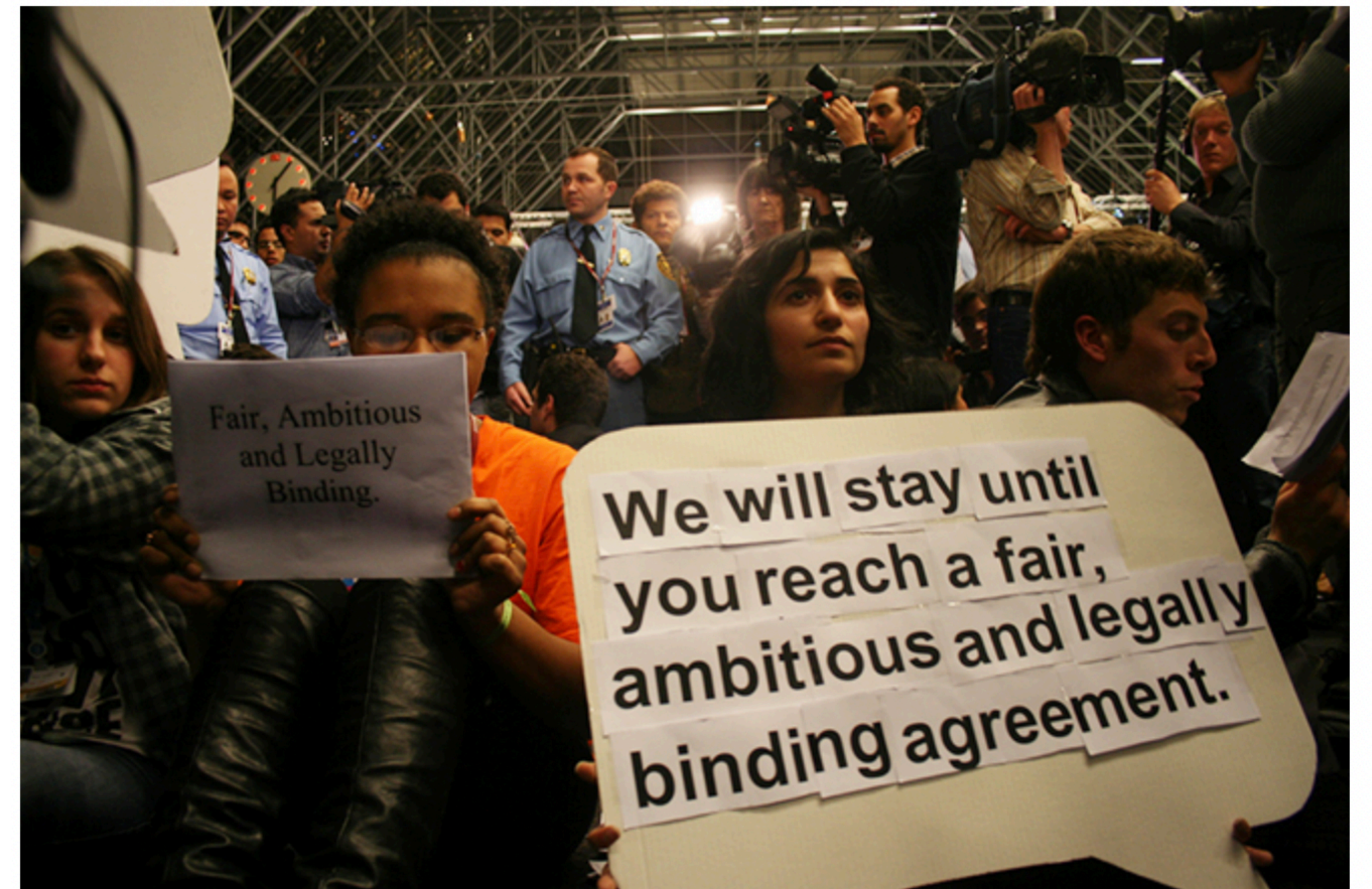
A sit-in protest at the COP15 in Copenhagen.

Was a failure of countries to come to a meaningful agreement