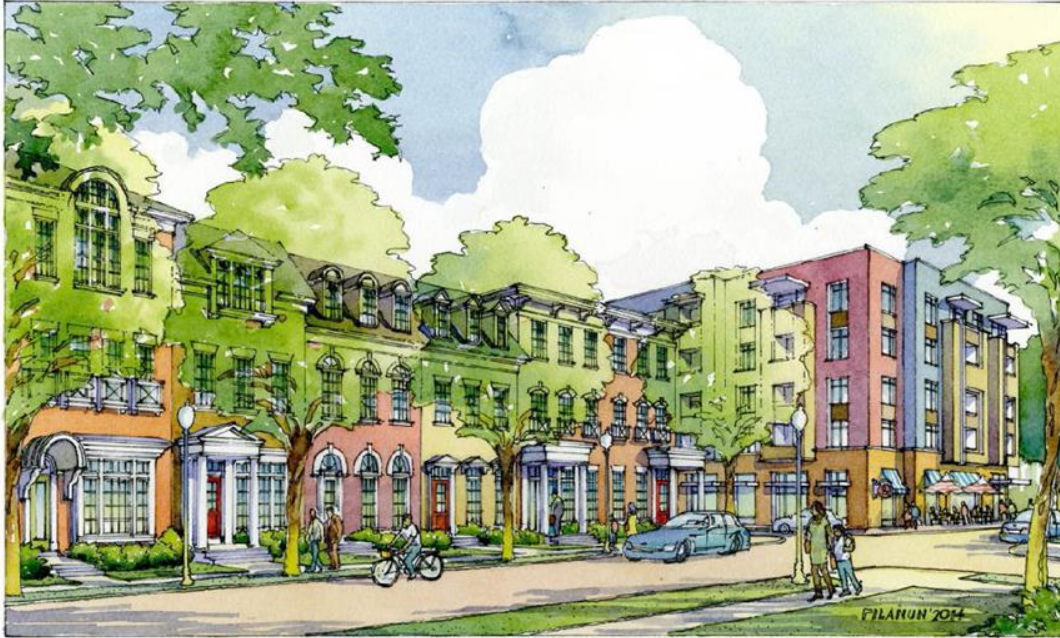
210 Maryland Park Dr.