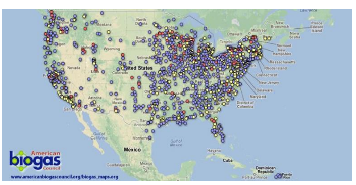
Figure 2: Operational biogas systems in the continental United States<sup>7</sup>

The United States currently has 2,200 operating biogas systems across all 50 states, and has the potential to add over 13,500 new systems.<sup>8</sup>