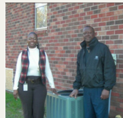
The Help My House program delivers clean energy in S.C.