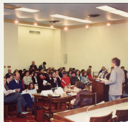
An early EESI Congressional briefing