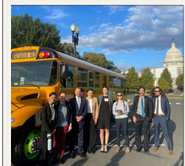
EESI brought an electric school bus to a Hill briefing