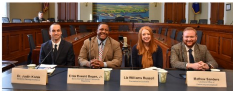
EESI briefing on community-centered resilience in Louisiana

2 Helping green banks apply for zero-interest federal loans to expand on-bill financing programs for more homeowners and small businesses