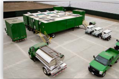
Cool Planet's pilot plant in Camarillo, CA. The first biorefineries will be built in Louisiana using woody biomass.

As detailed in the 2012 market report, there are a variety of different tax incentives and programs to encourage biofuel facilities, jobs, and related economic activity inside particular states. Variation in state-level incentives can prove to be a decisive factor when companies choose where to locate. For example, this summer Cool Planet publicly announced it will move its headquarters to Colorado from California owing to tax incentive that will save them $3M, provided they create 393 new jobs in the coming years.