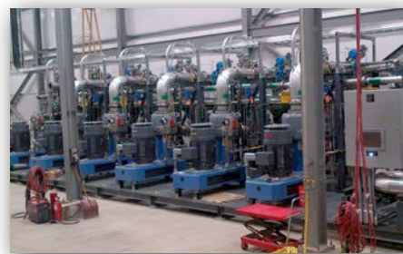
Edeniq's Cellunator mill produces sugar from plant materials.

Although there are not any announced plans for cellulosic butanol production in the coming years, this could be an attractive alternative for some companies exploring the alcohol-as-fuel market, as butanol may be blended with gasoline up to 16% without modification to vehicles.