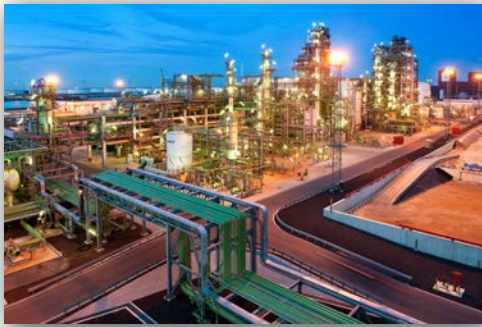
Neste Oil's NEXBTL plant in Rotterdam.

Global advanced biofuel development and production continues at a strong pace. Several European companies are producing cellulosic ethanol and renewable jet fuel at commercial scale. In Brazil, conventional sugarcane ethanol production continues to expand, both for domestic consumption and global export. 12 Producers are also working towards reducing the fuel's carbon intensity. In 2012, Brazil exported 540 million gallons of sugarcane ethanol to the United States, which continues the increasing trend since 2009. 13