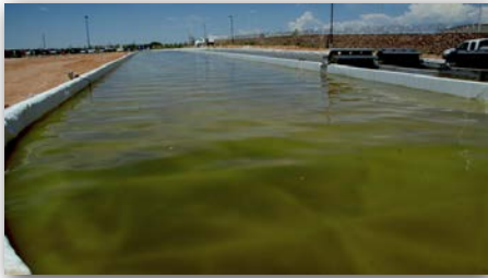
Sapphire Energy's Half Acre Algae Pond at its research facility in Las Cruces, NM.

Dozens of additional partnerships are listed in Appendix A. Details of each partnership are typically listed on bio-fuel companies' websites.