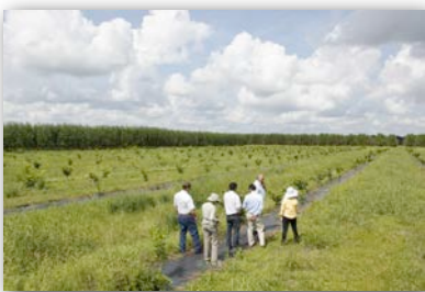
A field of young pongamia trees in southern Florida, which will produce an oil feedstock.

In response to litigation from interest groups, court decisions issued in the first half of 2013 have generally upheld the LCFS. However, these challenges have resulted in some delays in implementation of parts of the LCFS, including a recent delay of the increased 2014 target. The LCFS will remain at the one percent reduction level (the 2013 target) through 2014. Despite the marketplace uncertainty caused by such changes, the LCFS has delivered a fuel mix with lower carbon intensity. In 2012, Cali-