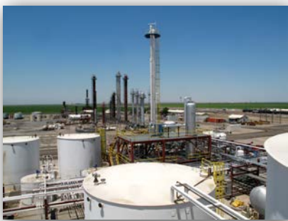
Crimson Renewable Energy, LP – Bakersfield Biodiesel and Glycerin Plant.

Cellulosic ethanol progress continues to be slow but steady. The INEOS plant in Florida began production in July, after a few months of mechanical delays. We expect