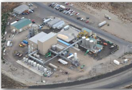
ZeaChem's demonstration-scale facility in Boardman, OR, processing woodchips for conversion to ethanol.

Advanced biofuel production is key to compliance with two important policies: the federal Renewable Fuel Standard (RFS) and California's Low Carbon Fuel Standard (LCFS). RFS is a volumetric mandate that requires specific levels of a variety of renewable fuels each year and includes an advanced biofuels mandate. The LCFS is a performance standard that requires a gradual reduction in the carbon intensity of California's fuel mix between 2011 and 2020. We use our domestic capacity projections to assess the industry's potential to meet these standards and discuss the policies themselves in section V. For both standards, it is possible there will be additional capacity beyond projects tracked by E2.