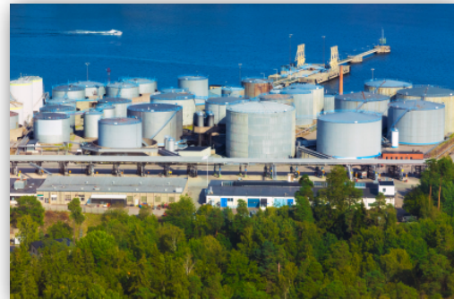
Fuel storage facility in Stockholm, Sweden.

E2 compiled a list of 24 companies working internationally on advanced biofuel projects of particular interest to the U.S. This does not reflect the full scale or capacity of the global market, but should be understood as a survey of international activity that could be imported to the United States or technologies that may be licensed domestically. See Appendix D for a list of these companies.