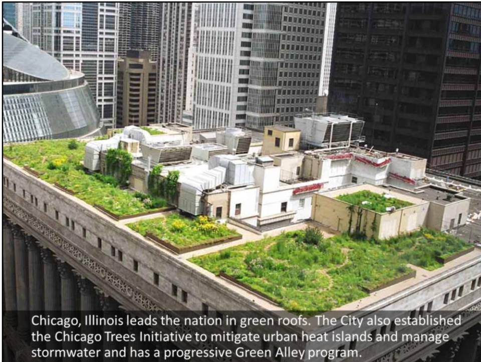
Chicago, Illinois leads the nation in green roofs. The City also established the Chicago Trees Initiative to mitigate urban heat islands and manage stormwater and has a progressive Green Alley program.

From a presentation at NLC's recent Midwest Regional Convening on Climate Resilience