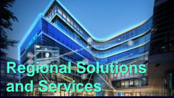
Regional Solutions and Services