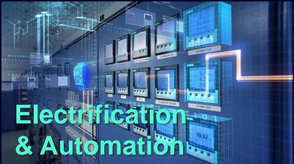
Electrification & Automation