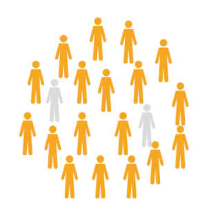
87% of survey respondents say they share briefing information with others.