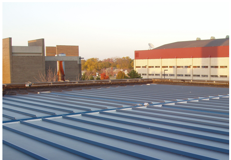
University of Detroit-Mercy (10kW) Detroit, MI

Call 1.800.528.0617 or visit us at www.uni-solar.com