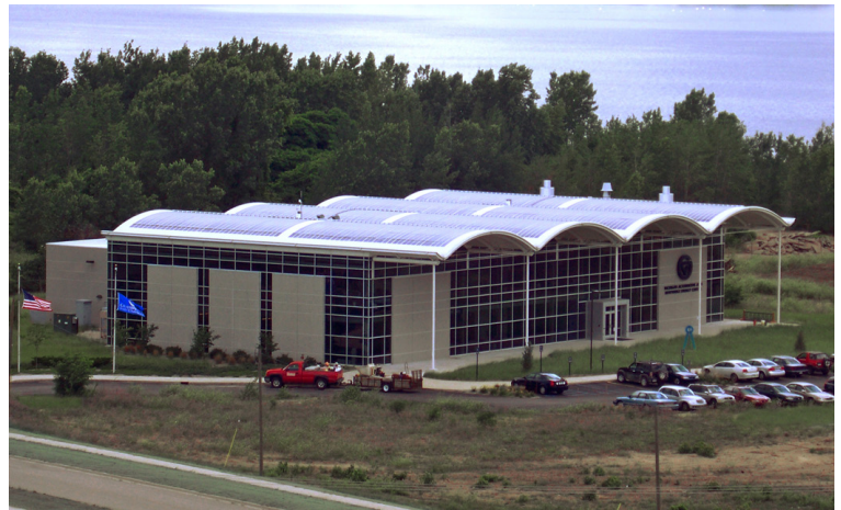
Michigan Alternative and Renewable Energy Center (30kW) Grand Valley State University, Muskegon, MI